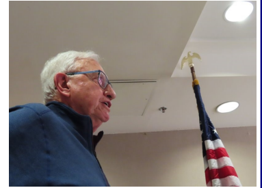
Proudest Grampa ever!!!