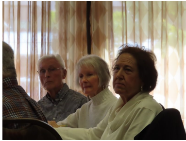
The Judges are ready!

The topic is “ The Magic of Rotary ” and how it affects their lives.